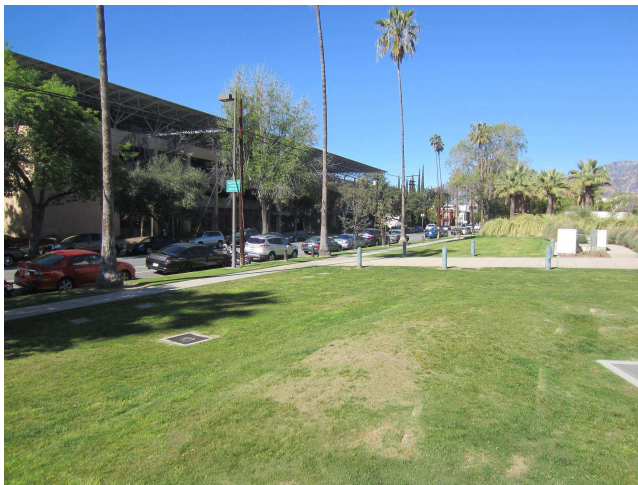
Upper left: Exterior of Beckman Institute from Wilson Ave.