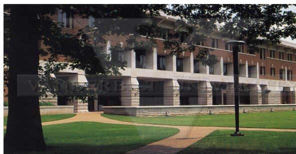
The meeting will be held at Wilson Hall at Vanderbilt.