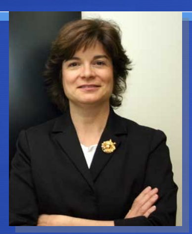
Carolyn Porco Public Talk at Boulder, 2008.