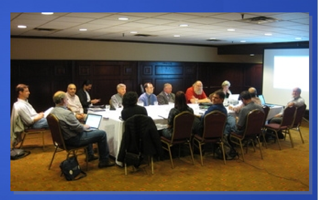
Committee Meeting during 2010 Boston Meeting